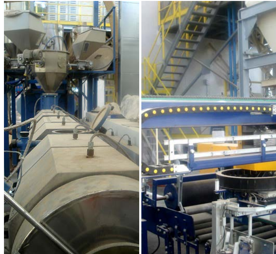
Photos: Co-operation partner: AGRINDUSTRIA TECCO s.r.l., Cuneo, Italy